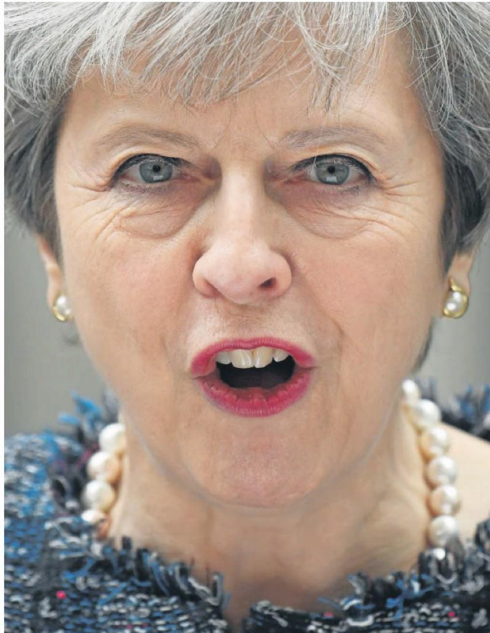
Theresa May speaks outside No 10 after her audience with the Queen at Buckingham Palace

"But the events of the last few days have shown that whatever our wishes, and however reasonable the positions of Europe's other leaders, there are some