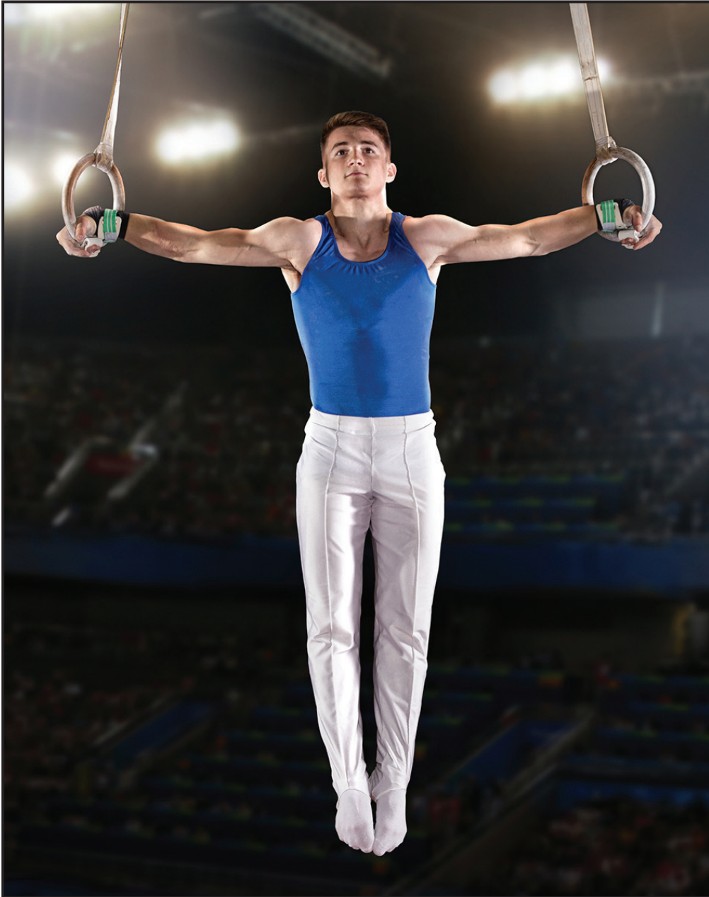
Figure 2 – A gymnast performing a static crucifix on the rings.