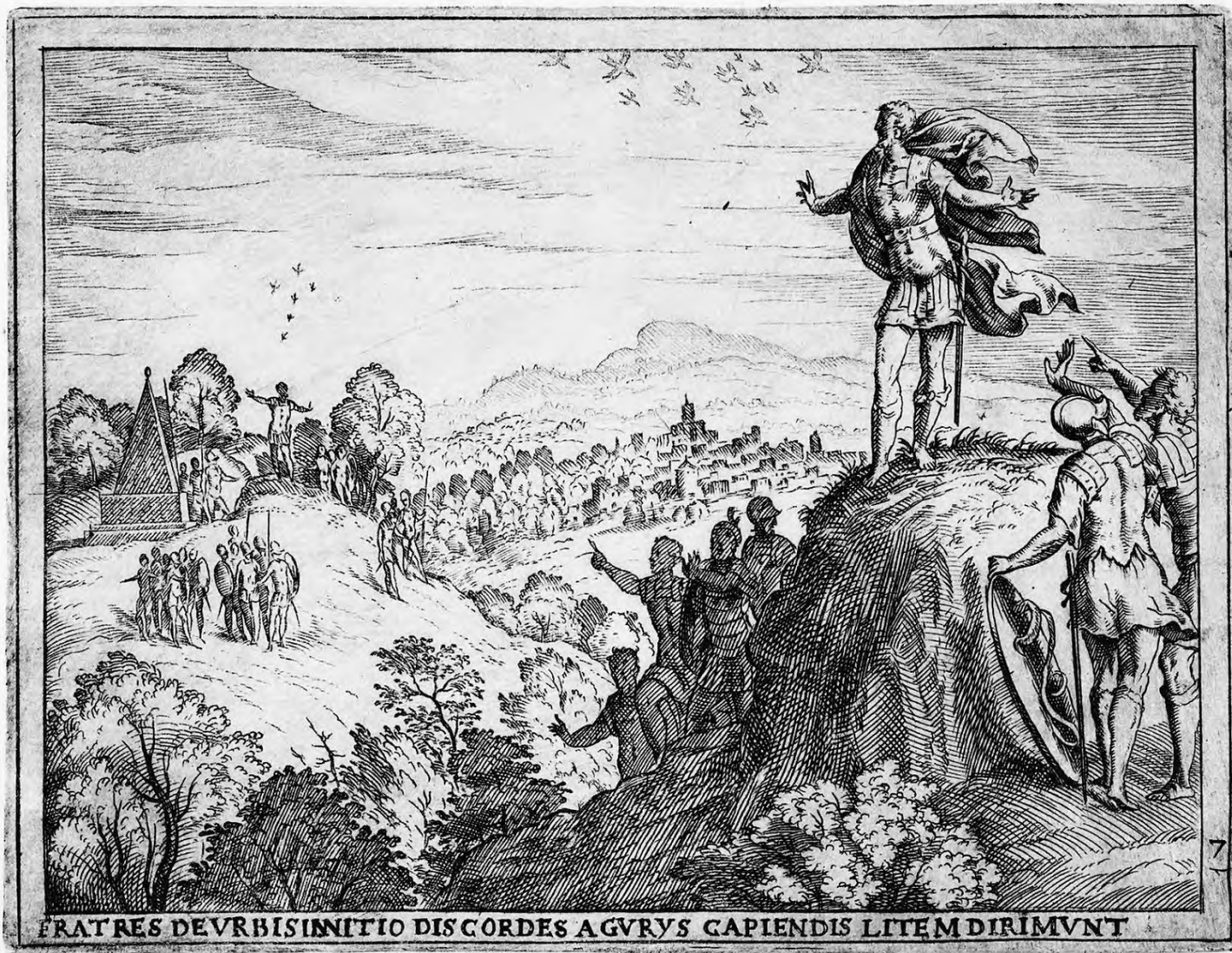
Caption: FRATRES DEURBISIDNITIO DISCORDES AGURYS CAPIENDIS LITEM DIRIMUNT