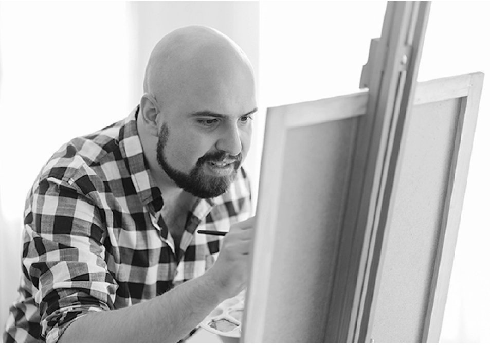
An image shows a man painting.