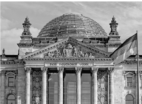
das Parlament des wiedervereinten Deutschlands

An image shows a parliamentary building with a flag outside.