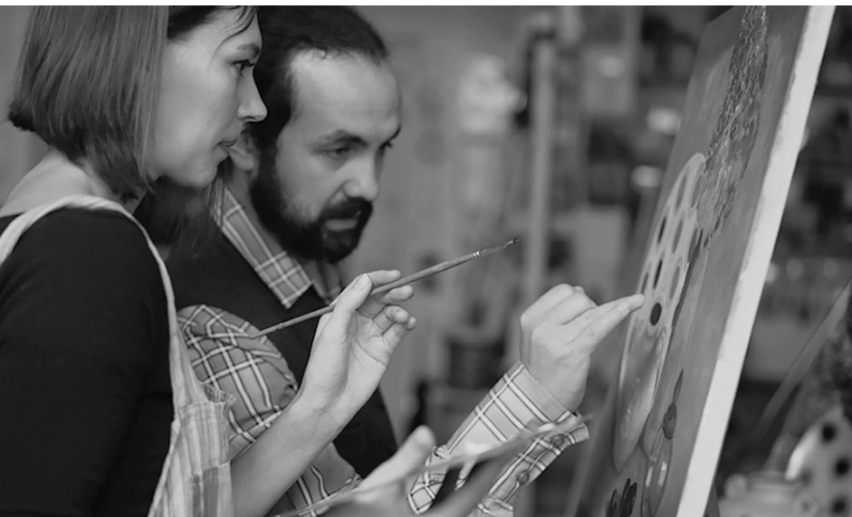
An image shows a woman holding a paintbrush and paint palette in front of a painting. A man is standing next to her and pointing at part of the painting.