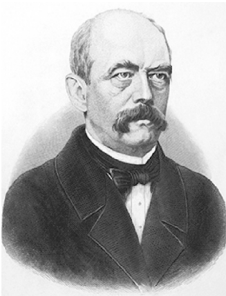
Reichskanzler Otto von Bismarck

Das „Berlin Story Museum“ in einem Luftschutzbunker aus dem Zweiten Weltkrieg.