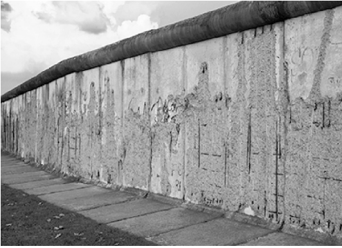
die Berliner Mauer 1961–1989