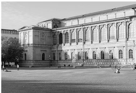
Alte Pinakothek (eröffnet 1836) Malerei des 14. bis 18. Jahrhunderts, z.B. Raffael, Rubens, Dürer

Drei benachbarte Kunstsammlungen („Pinakotheken“) bilden das sogenannte Kunstareal in München.