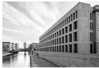
moderne Fassade an der Ostseite des Schlosses