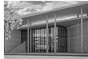
Pinakothek der Moderne (eröffnet 2002) Kunst der Gegenwart, z.B. Beuys, Kiefer