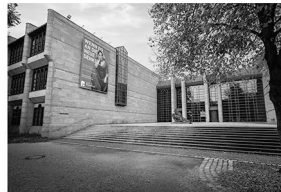
Neue Pinakothek (eröffnet 1981) Kunst des 19. und 20. Jahrhunderts, z.B. Monet, Klimt, C.D. Friedrich