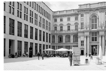
der Innenhof – offen für alle