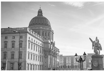
das Berliner Stadtschloss, im Krieg zerstört, jetzt rekonstruiert

Im wiedererbauten Berliner Stadtschloss wurde 2021 das „Humboldt-Forum“ eröffnet.