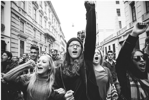
300.000 Demonstranten im Jahre 2020 „Gleiche Rechte für alle!“