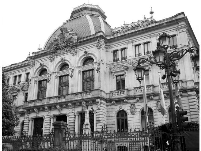
El Parlamento de Asturias

El asturiano, también conocido como el bable, no se reconoce como lengua oficial en España pero ya es “oficial” en el Parlamento de Asturias.