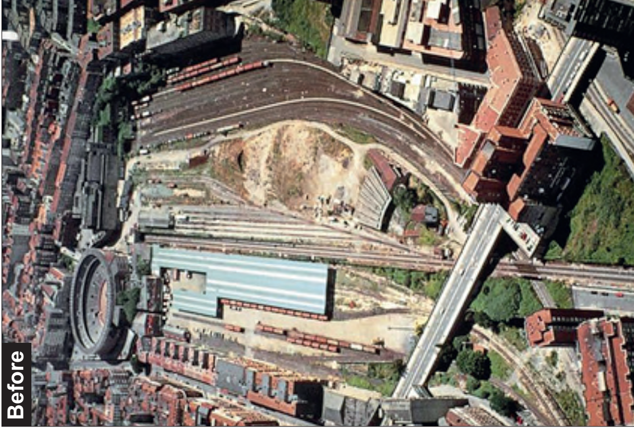
Figures 2a and 2b: An industrial area in Bilbao that has been regenerated